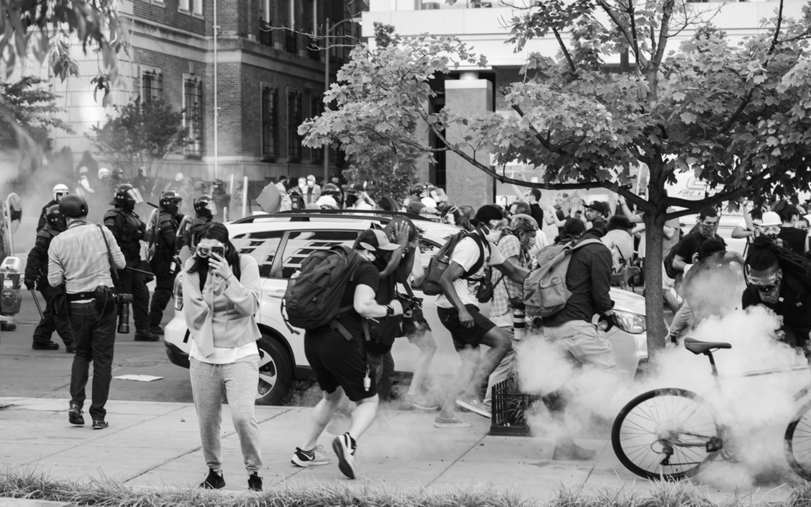
Law enforcement used tear gas to clear protestors away for President Trump's photo in front of St. John's Episcopal Church.

for that night and the next. 6 She ordered that “[d]uring the hours of the curfew, no person, other than persons designated by the Mayor, shall walk, bike, run, loiter, stand, or motor by car or other mode of transport upon any street, alley, park, or other public place within the District.” Id. The order carved out exemptions for essential workers, persons engaged in activities related to the June 2 D.C. primary election, and travel to and from hospitals. Id.