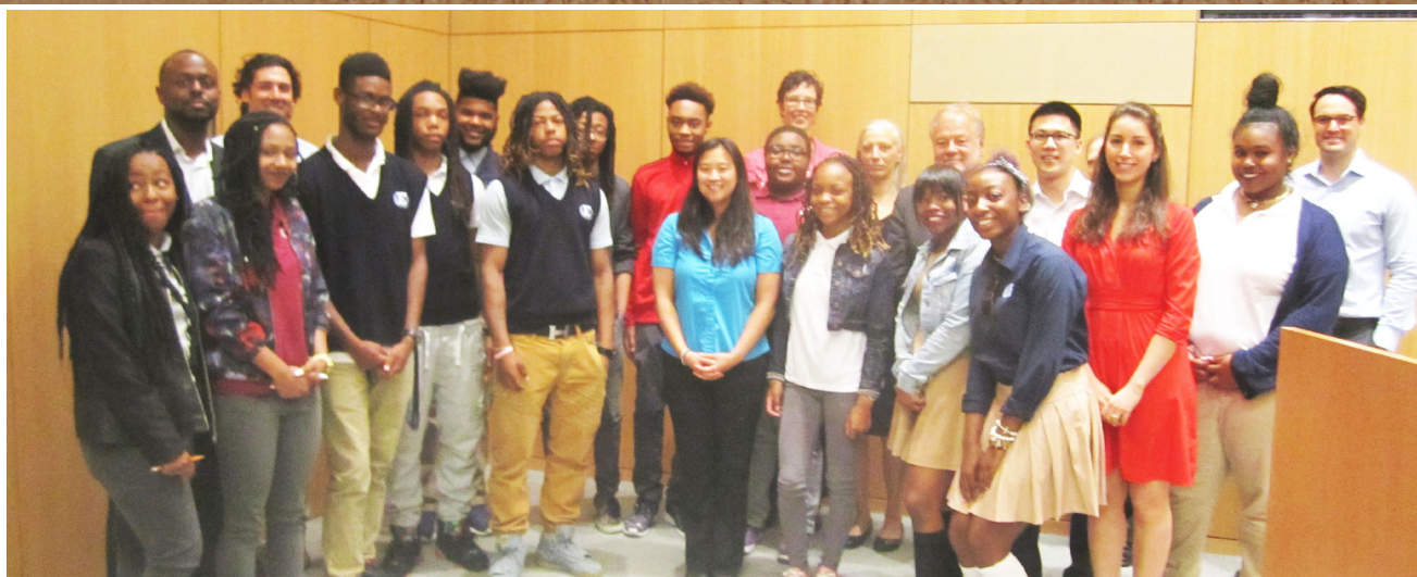
Debaters from Eastern and McKinley Technology High Schools with judges and organizers.