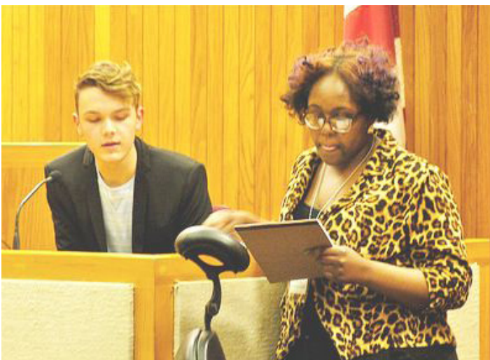
Mock trial attorney questions a witness.

The mentors also helped the students hone their courtroom skills to prepare for their mock trial in April, which is the culmination of their Street Law course.