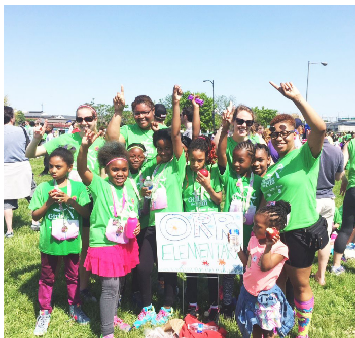
Girls on the Run team from Orr Elementary School. The team was sponsored by Zuckerman Spaeder.