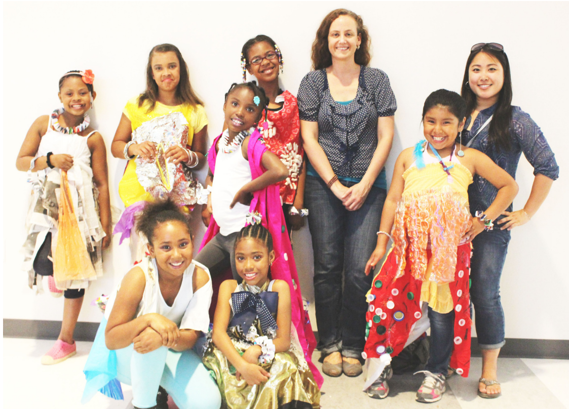
Tyler Elementary School Trashion Fashion "models" with their teachers.