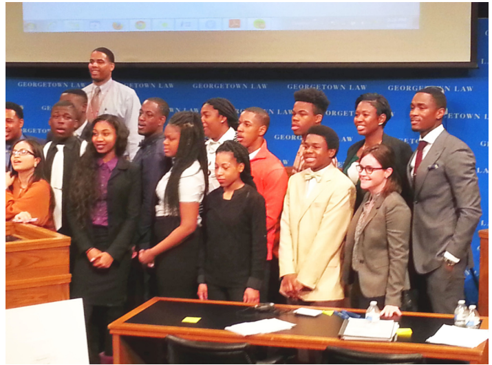
Winning Mock Trial team from Anacostia High School.