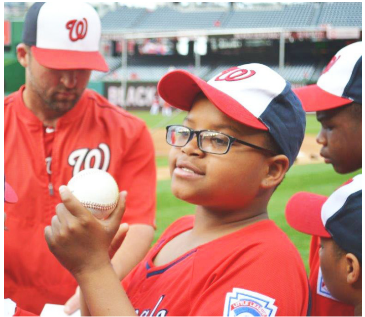
Savoy Elementary student at Nationals Park outing organized by Beveridge & Diamond.

The firm will also be supporting girls softball at Savoy.