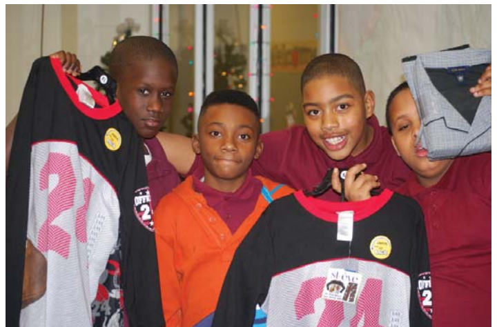
J. O. Wilson students with their new pajamas provided by the EEOC.

The school administration and faculty were delighted to have 200 plus pairs of pajamas to give to students with the greatest need before the holiday break.