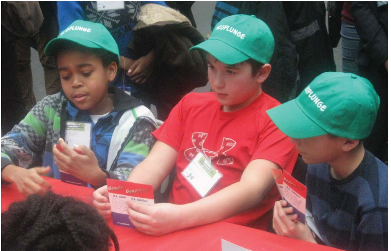
Winning GeoPlunge team from Alice Deal Middle School.