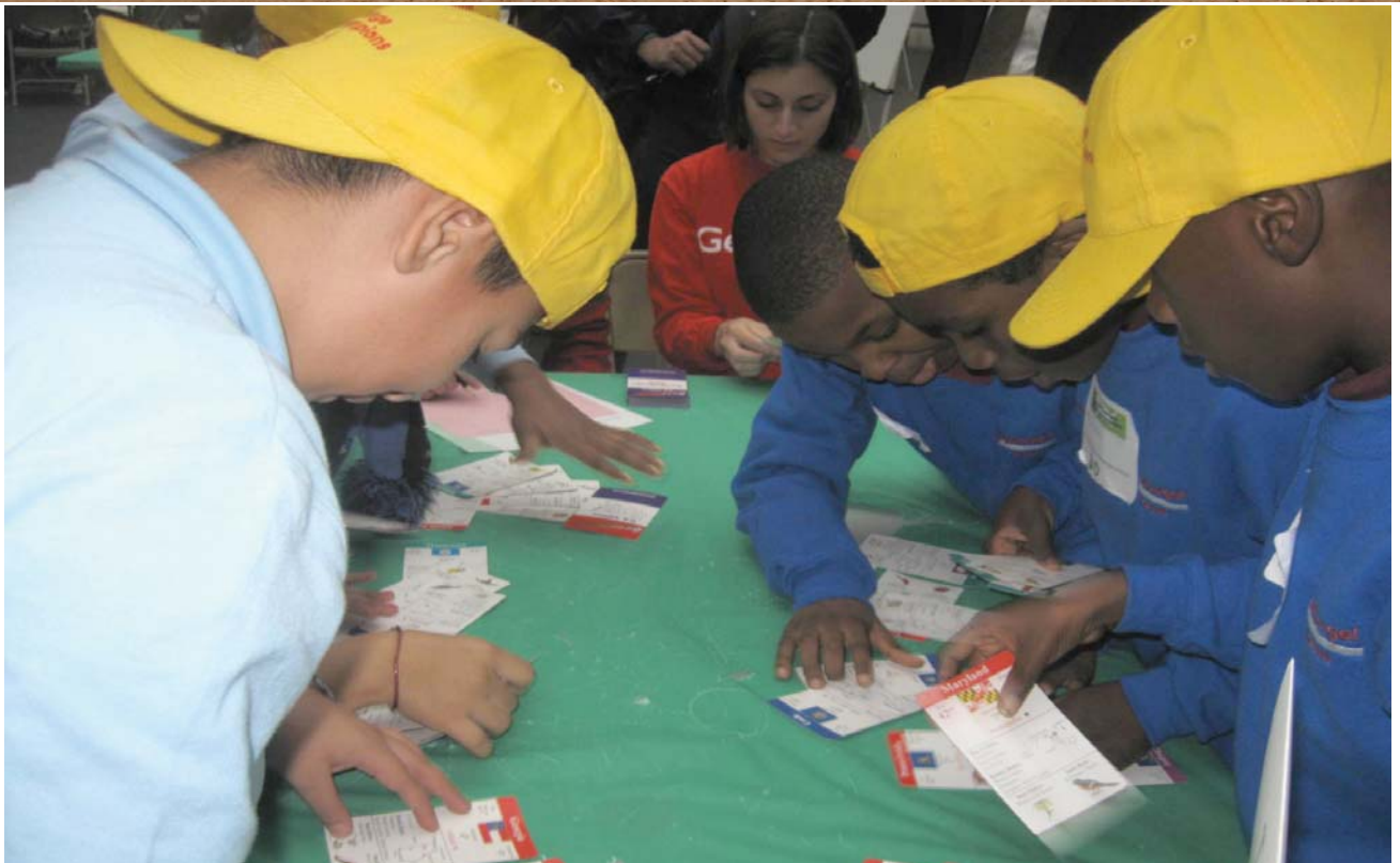
Two teams "Race for the Borders" during the 7th City-Wide GeoPlunge Tournament.