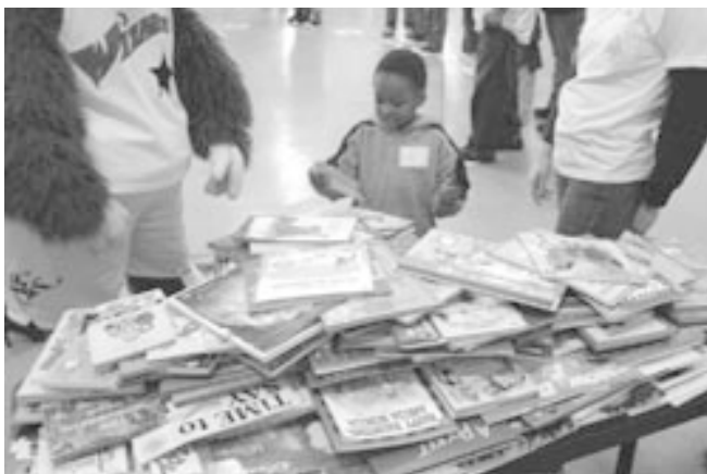
Van Ness student selects his prize at Bracewell's Big Book Party.

At the beginning of the school year, Fried Frank provided space and lunch so that the Walls faculty could spend a staff development day at the firm. During lunch, the faculty and attorneys and staff from Fried Frank discussed partnership activities.