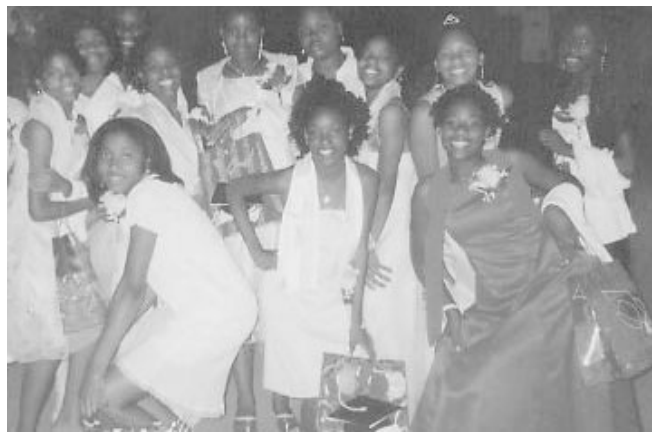
6th grade girls from Malcolm X at their annual dinner dance sponsored by GWAC.