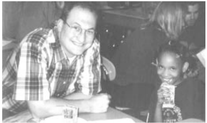
McDermott Will & Emery tutor with a student from Bowen Elementary School.