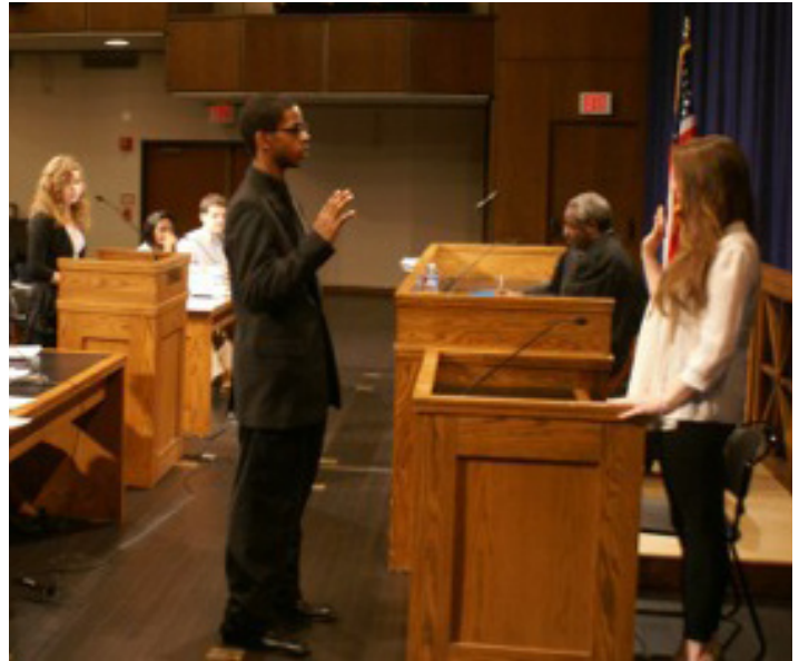
Students from the School Without Walls Defense and Plaintiff teams begin the final round of the DC High School Street Law Mock Trial Tournament.