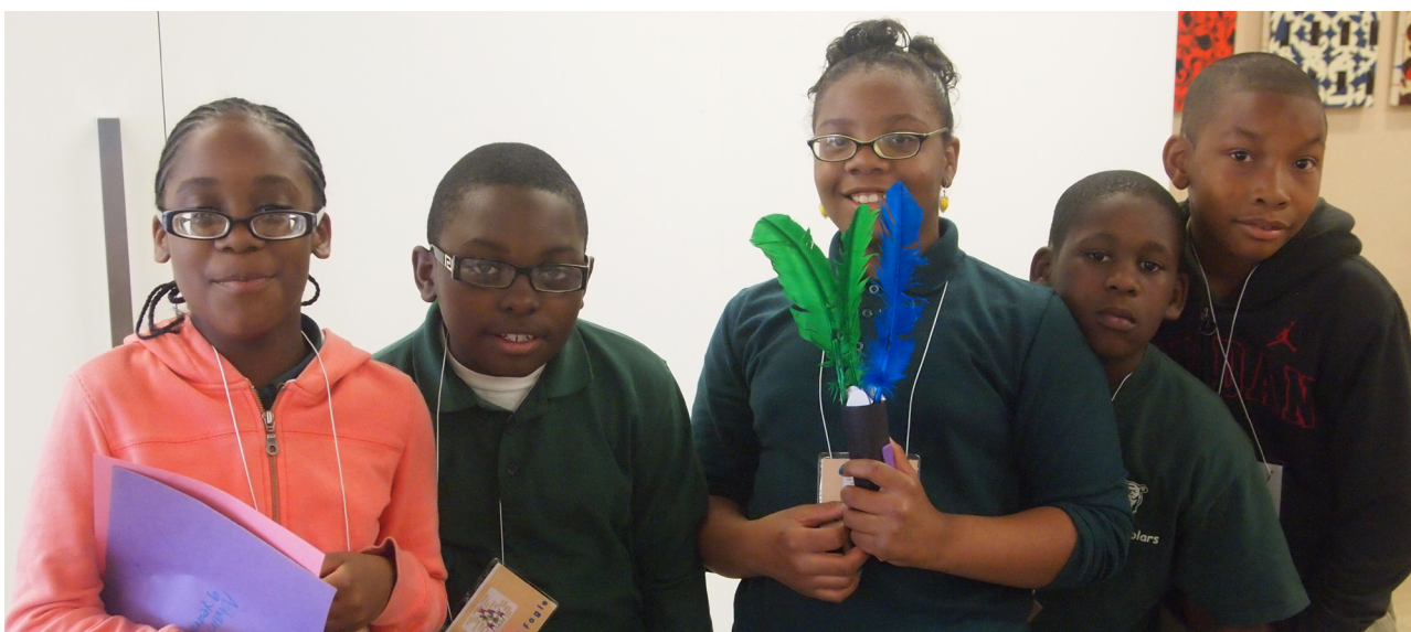
Students from Davis Elementary School at Crowell & Moring's Take your Kid to Work Day.