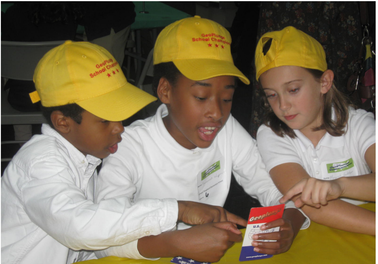
GeoPlunge team from Shepherd Elementary School decides on its next move.