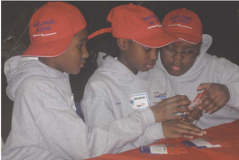
GeoPlunge Champions from J. O. Wilson Elementary School.