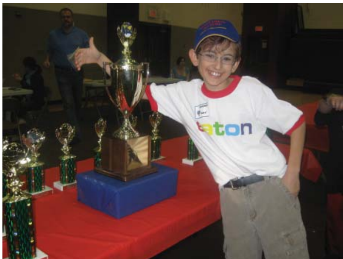
Geoplunge competitor from Eaton Elementary School with tournament trophies.

Amidon Bowen Elementary School students did very well on the math tests they took last spring. More than 40 volunteers from McDermott Will & Emery who tutor the students are very proud of this success and determined to help Amidon Bowen students improve their reading scores next spring.