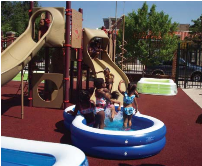
Pre-K students at Cleveland Elementary School enjoy a day at the "beach," courtesy of Holland & Knight.