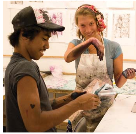
Because of their Dickstein Shapiro scholarship, these Ellington students are able to study printmaking at the Anderson Ranch Arts Center

Akin, Gump, Strauss, Hauer & Feld undertook a similar project at Tyler Elementary School. Akin Gump's effort also included rewiring Tyler to make it possible for students to connect to the internet. Law firms often also provide printing for their partner schools.