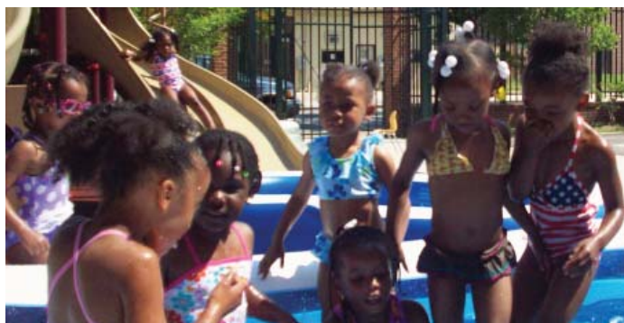
Pre-K students at Cleveland Elementary School enjoy a day at the "beach," courtesy of Holland & Knight.