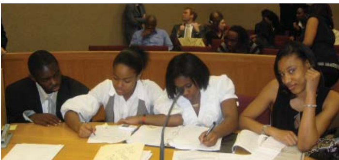
Members of the Duke Ellington's 3rd Runner-up Plaintiff Team in the 2008 citywide Street Law Mock Trial Tournament.