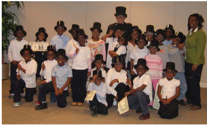
Bowen Elementary students assume the role of magicians at the annual holiday party sponsored by McDermott, Will & Emery.