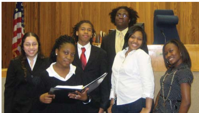
Ellington's Defense Team, winners of the 2008 citywide Street Law Mock Trial Tournament.