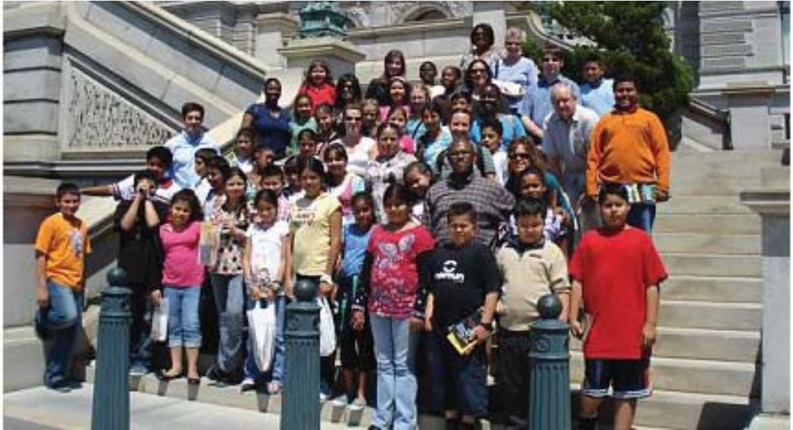
Howrey tutors and Bancroft students at the Library of Congress during their end-of-year field trip.