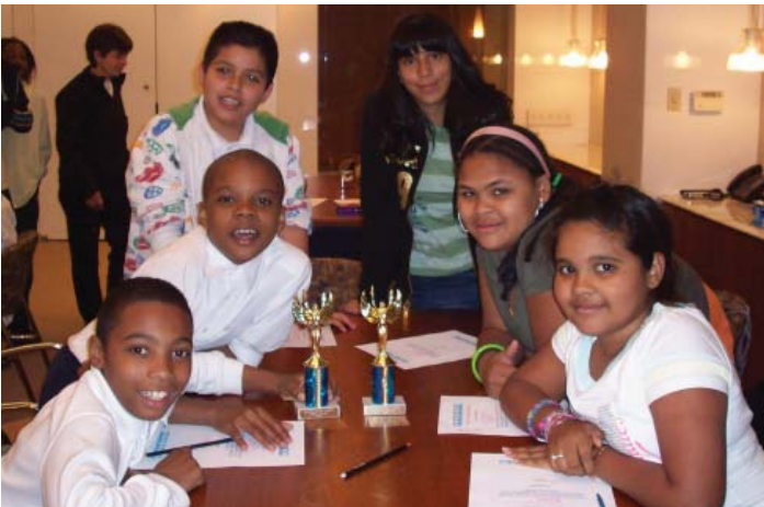
Winners of last spring's mini-GeoPlunge Tournament. On the left is the first-place Cleveland team; on the right, the second-place Eaton team.

A volunteer crew from the Office of the Attorney General (OAG) painted the walls of the library at Terrell Junior High School. The OAG also provided new furniture and book covers.